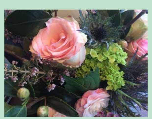
An arrangement of roses, camellia, star thistle and heather is cheerful and uplifting.